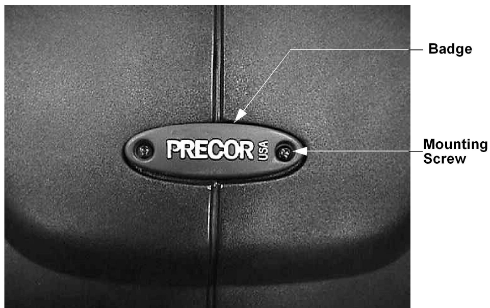
Diagram 7.21 - Rear Cover Badge